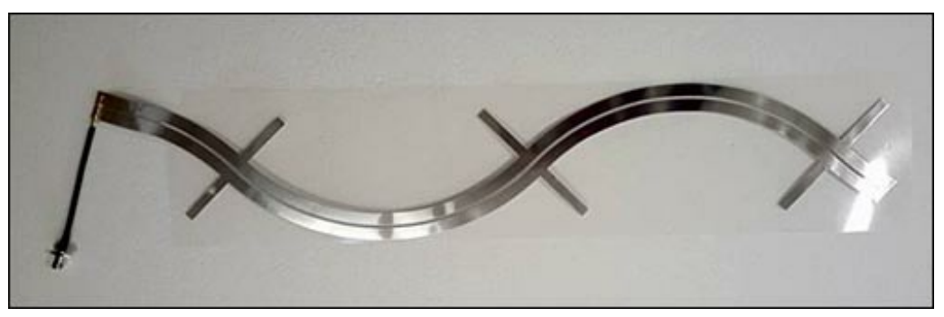
NeWave's Wave antenna—two of which are contained in each smartPORTAL—is designed to generate a uniform RF field.

At each side of the approximately 8-foot-wide dock doors, Johnson Controls bolted a smartPORTAL to the floor, according to Jeff Hudson, SLS' CEO. A total of 1,200 smartPORTALs were installed at 600 dock doors within 37 facilities, in order to read the tags of containers arriving at and exiting each location. With the Wave antennas built into the towers, Hudson explains, the system knows in which direction every tag is traveling.