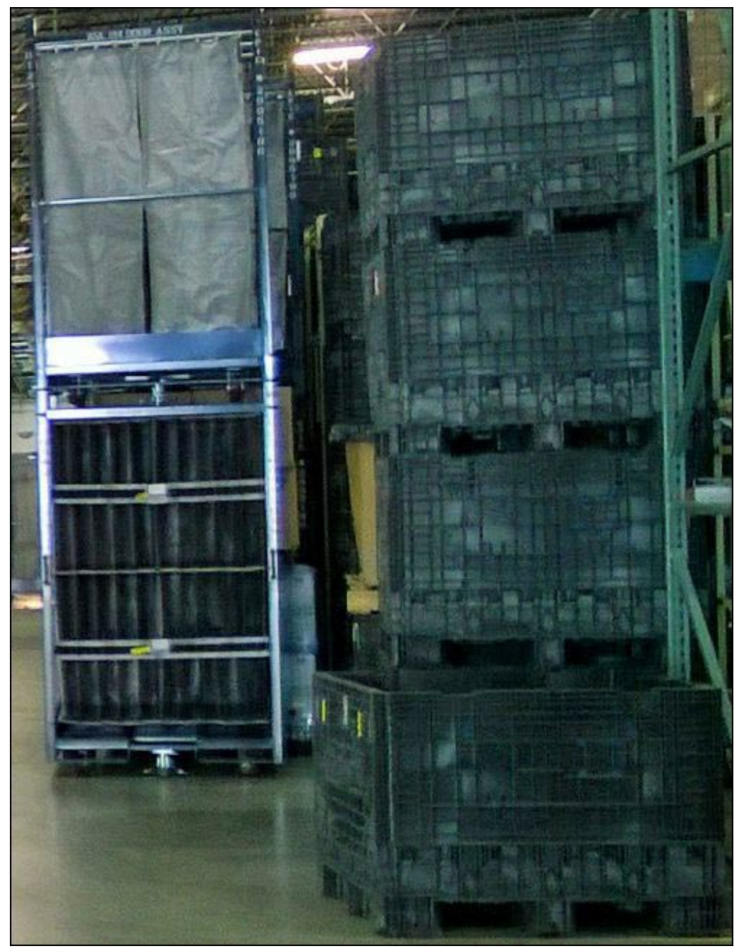
Johnson Controls' tagged reusable container

"RFID is pretty tricky for the automotive environment," Wappler adds, due to the high level of metal and fast-moving goods in high volume. "We had to find a way to use the software, the reader hardware and the tags in a unified orchestra." Once the system was proven and fully installed, he says, it was found to have a read accuracy rate of more than 99 percent.